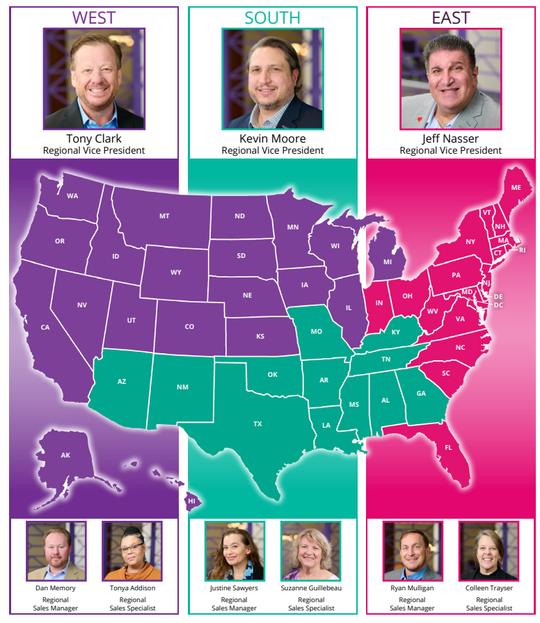
For sales management team contact information, please see our Home Office directory .